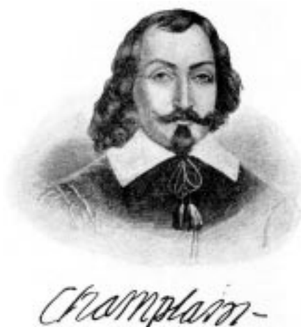
Figure 2- Samuel de Champlain (1567-1635) founder of Quebec City

The Province of Québec is considered to be also the birthplace of chemical education and metallurgy in Canada. Two institutions contributed mainly to this reputation: Le Collège de Jésuites founded in 1635 and