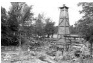
Figure 6- A view of the Forges in 1970s