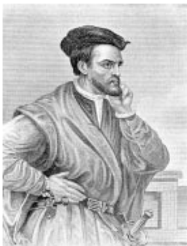
Figure 1- Jacques Cartier (1491-1557) discoverer of Quebec

The period in the history of Canada known as New France was about 200 years, full of wars and revolutions but also was associated with intellectual activity and social change. It has its origin when Jacques Cartier (Figure 1) landed in 1534 for the first time in Gaspé in what is known today as the Province of Quebec, to take possession of the land in the name of the King of France François I. It was, however, Samuel de Champlain (Figure 2) who in 1608 founded the city of Québec and established the first French permanent settlement on this continent which extended gradually to Gulf of Mexico and became known as New France (Figure 3). This new empire ended in 1760 when the British defeated the French and took over the colony. Very shortly afterwards, the British had a revolution in their North American colonies in 1775 and the French had it in their own country in 1789.