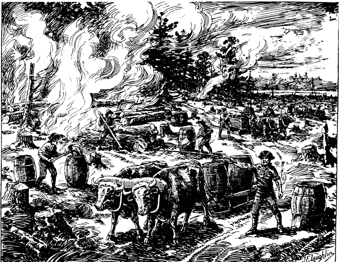
Figure 4- Production of potash in New France

The first attempt of iron production in Saint Maurice was in 1733 by François Poulin de Francheville (1692-1733), a rich French merchant from Montreal who sent three smiths to New England to collect information for building a forge. Because of the limited funds available to him he was forced to build a short furnace fueled by charcoal to which air was blown by small bellows. The temperature of combustion was