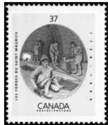
Figure 8- A stamp issued on the occasion of 250th anniversary of the Forges