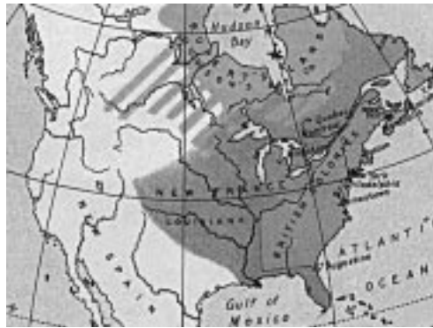
Figure 3- New France

The story of the Forges dates back to 1667 when iron ore was discovered in the neighbourhood of Trois Rivières. It was investigated by an engineer named