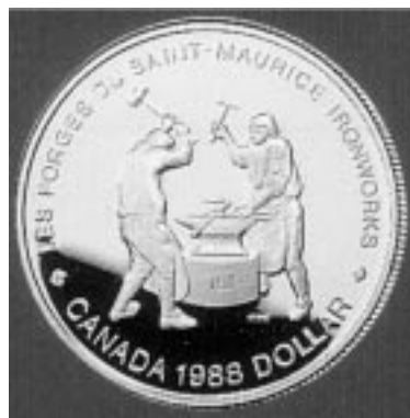
Figure 7- A commemorative dollar 1988