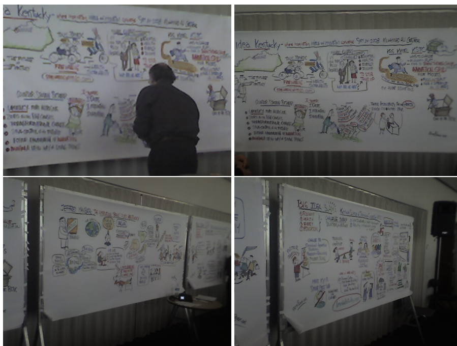
Figure 1: Cartoonist at the Idea Kentucky Think Tank.

strips by Bill Watterson, to name a few related works. Still, none of these works or any others I found were simultaneously plot-driven and instructional.