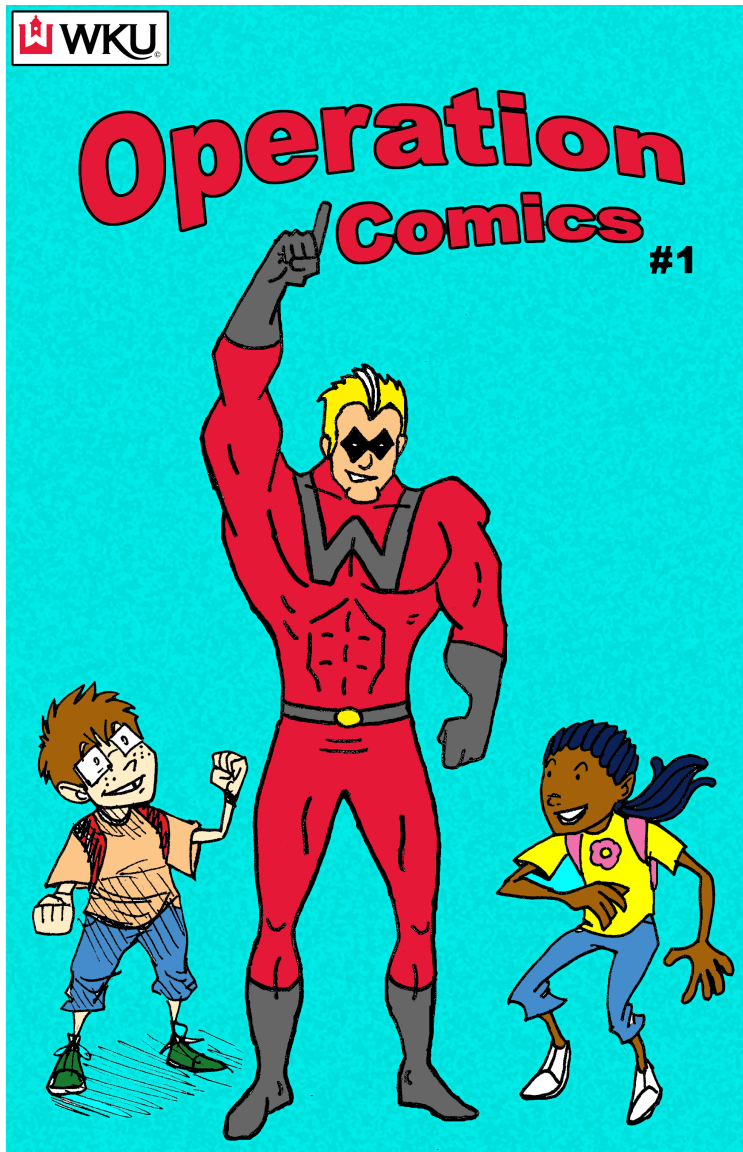
Figure 2: Cover to the first edition of Operation Comics.

Wonderguy. Wonderguy is the supposed “lead” character of each of the stories, which will be centered around his adventures in crime-fighting. Wonderguy is incredibly strong, but his brains do not match his brawn, a fact that is not part of his public perception. He is an immensely popular public figure, even perhaps a bit of a celebrity. His origins are left purposefully vague, although it is clear from the way that he carries himself that he has always had his super-powers.