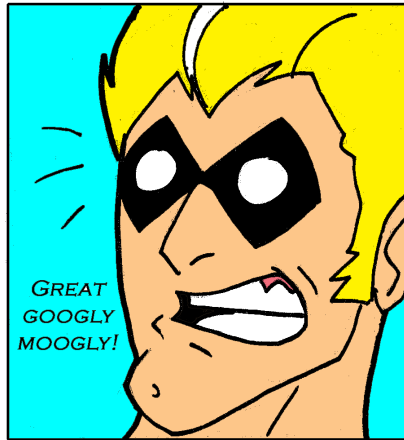
Figure 3: Our “hero”, Wonderguy.