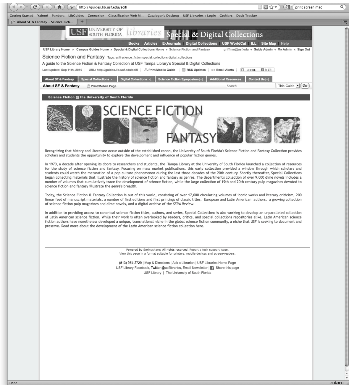
Figure 1: Science Fiction and Fantasy collection guide homepage