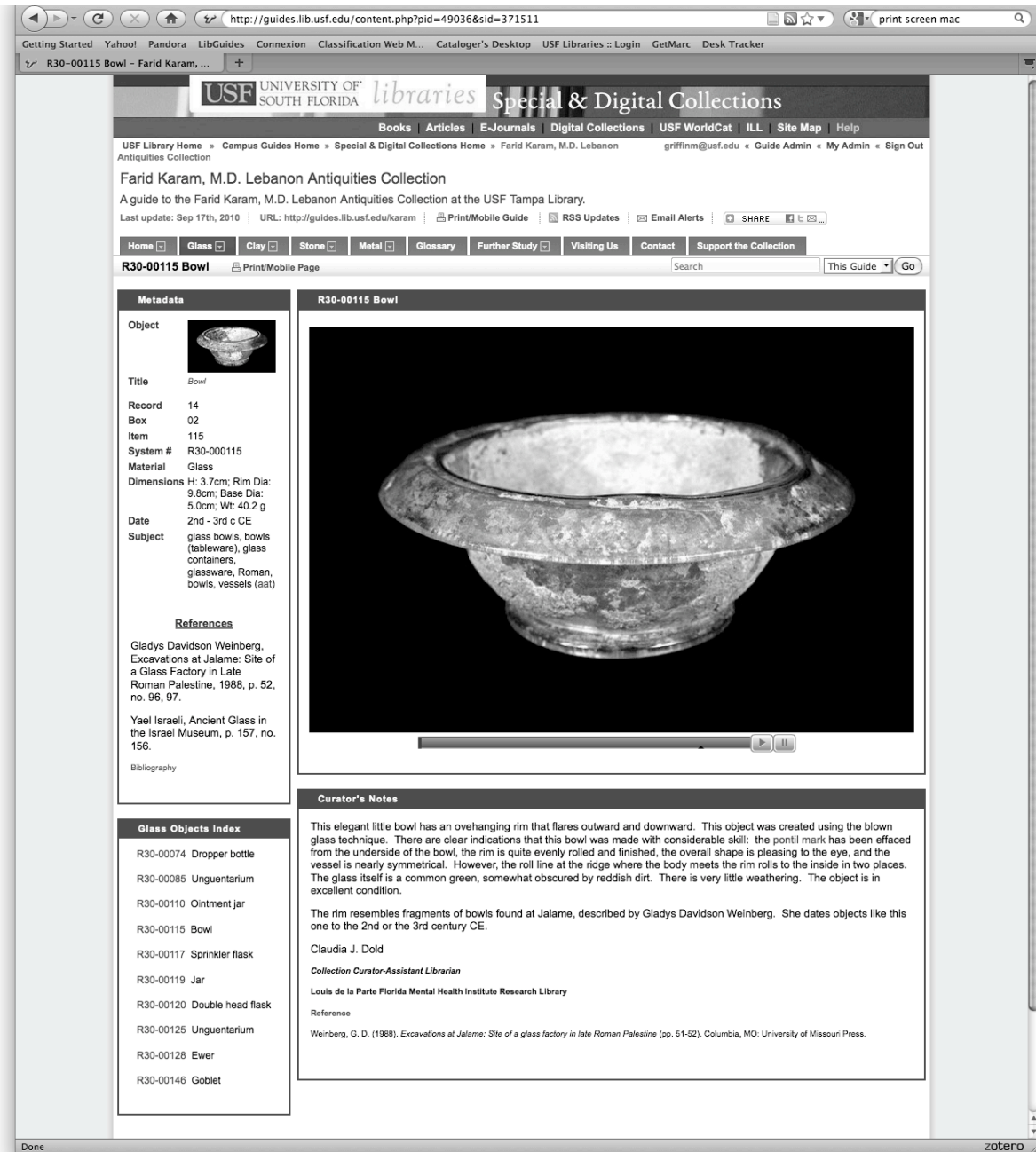
Figure 2: Embedded digital content in the Karam Lebanese Antiquities collection guide