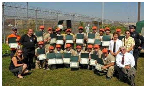
Certifications were handed out to 36 participants in September 2009 who completed a summer-long program that saw them planting and tending to a 13,000 square foot garden located on the grounds of the Cook County Jail.

If interested in receiving a copy of the video, please contact Robert Mindell at rmindell@cookcountygov.com