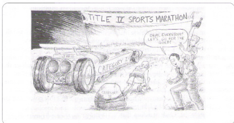
FIGURE 1. Cartoon by Seth Casana courtesy of The Breeze (James Madison University).

tied to a huge rock. Students would also notice that while the car's nose is at the starting line, our runner is positioned some distance behind that line. Two possible warrants for this cartoon are that that these two depictions suggest unfair advantages and that the real-life situation is similar to the race. A third warrant could be that the new sports plan creates unfair competition between the two sports categories. Students would then have to determine whether they "get" the warrants, and if they are valid for this audience and this context. Does a match between a racecar and a tied-down runner equal an unfair race? (Most would likely answer "yes" to this question.) Does this depiction accurately represent the actual situation? This last question would elicit varying answers depending on student involvement or interest in Category I or Category II sports. Their responses would also change if they weren't interested in competitive sports at all. The same holds true for students' response to the third warrant. Is it true that the new plan creates unfair competition between these sports categories? Turning the warrants into questions works well to illustrate the variability of the audience's perspectives and the impact that variability may have on the success of warrants and ultimately on the cartoon's humor and/or message.