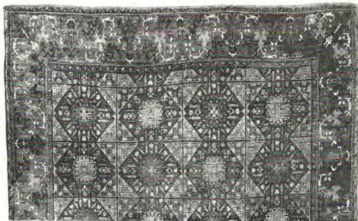
PILE CARPET, "Chessboard" or compartment style, Eastern Mediterranean, 16th or 17th century, The Textile Museum #R34.34.1. Acquired by George Hewitt Myers in 1927.

The Textile Museum has the largest and most important collection of Mamluk carpets in the world. Although the collection is well-published (but for six examples acquired in recent years), it has rarely been seen. Selections from the collection were last exhibited in 1981, and before that in 1970, with individual carpets on view in Washington, or lent for temporary exhibitions around the country. Two important carpets in the collection were not selected for exhibition due to the fact that they had been on view recently for extended periods