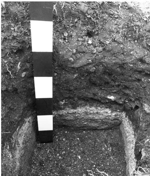
Figure 3: Crushed and highly compacted shell layer at 50 cm depth in Unit 6-8 at site 35CS43 (Byram 2006).

In historic Bandon, on the southern Oregon coast, the Nasomah Village site (35CS43) has been investigated by several archaeologists (summarized by Byram and Purdy 2007). In 2004, Coquille Indian Tribe investigations included a single test unit that contained a dense, compact, crushed shell feature interpreted as a shell road bed (Byram 2006). The unit was located at Cleveland and First streets, the former location of the 19 th century Bandon Ferry landing. This unit was excavated during attempts to relocate a buried water main and, once encountered, the crushed shell lens was left largely intact (Figure 3). Overlying fill consists of mixed road gravel, silt, and rubble related to town rebuilding after fires. Other test units in the area showed intact shell midden and/or disturbed deposits, but no dense layers of crushed shell. The feature may extend beneath the nearby modern road pavement. Given its location and depth, the shell feature was likely the surface of an early city street or the road approaching the ferry landing.