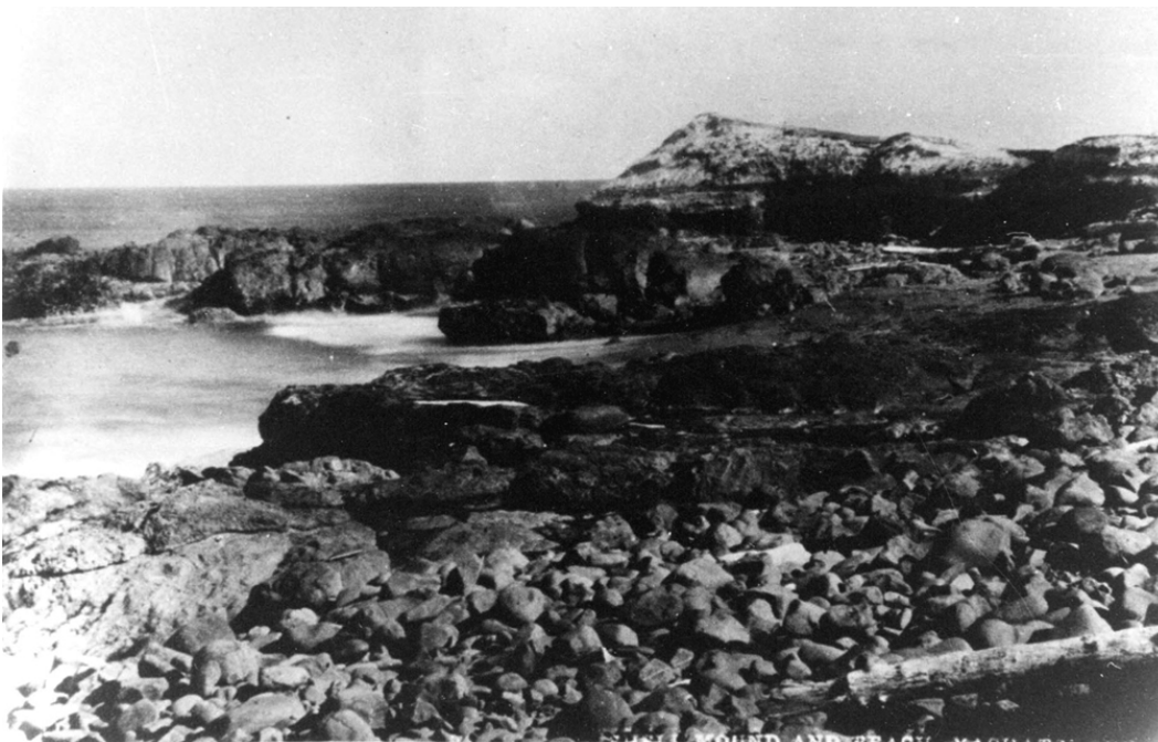
Figure 1: Shell mounds on the coast at Yachats ca 1910, reported to be 28 feet high (Lincoln County Historical Society).

As early as the 1870s, archaeologist Paul Schumacher (1877) made observations about the loss of shell middens due to town development at Gold Beach. His observations were echoed by later surveyors including Berreman (1935 a, b) and Collins (1951). There are also numerous ethnographic accounts from elders in coastal tribes discussing formerly large shell mounds (Harrington 1942:[23]:265, 689, 690, [24]:514).