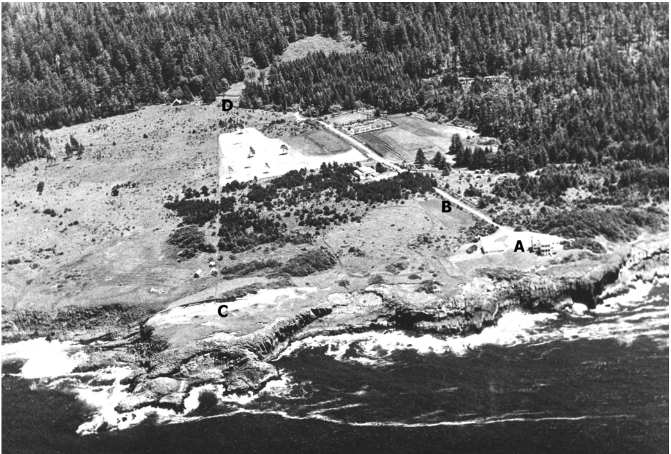
Figure 2: A 1930s photograph of the Maling Estate (A) at Cove Point depicts a shell road (B), and the possible remains of a large shell mound (C) that has been partially excavated. Highway 101 (D) in the distance follows the route of the coastal shell road depicted by Weatherford in 1911 and Burton in 1912 (Letters A-D have been added.)

If Weatherford was even marginally accurate in his description of this road, the scale of this impact on nearby shell mound sites must have been enormous. A bed of shell six to eight inches deep, probably eight to twelve feet wide, and two miles long would have required some 70,400 cubic feet of shell. If the mounds averaged 25 feet in diameter as he described, rising to a 5.5 ft. terrace 10 feet in diameter, approximately 50 such mounds would have been needed to pave this one stretch of coastal road.