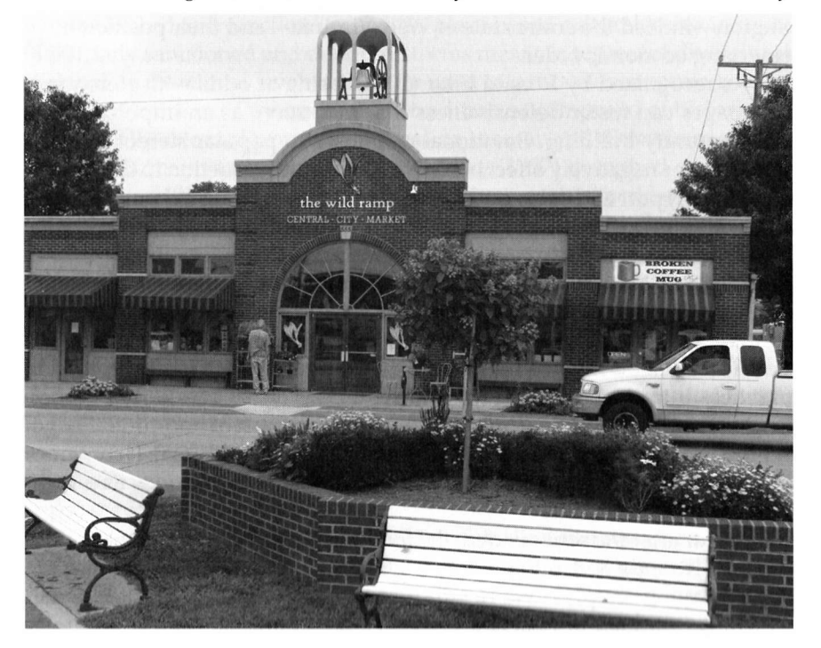
Figure 3: The non-profit, food hub "Wild Ramp" grew out of local efforts initiated through the Create Huntington Chat 'n' Chew community forums.