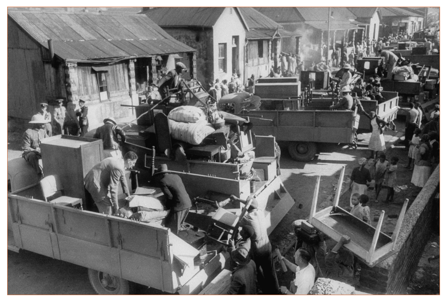
Families being evicted from Sophiatown, February 1, 1955.

the centuries—dispossession was part of a larger strategy to subjugate blacks whom white authorities considered sub persons not worthy of full and equal inclusion in the political community."