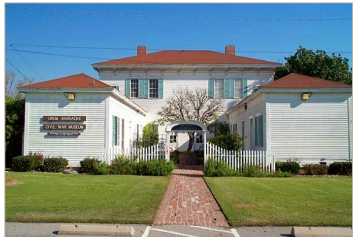
The last extant Civil War Era wooden building at Drum Barracks in Wilmington, California, now holds a Civil War Museum.

In either case, the Civil War sesquicentennial/WHA semi-centennial moment can motivate us to integrate Civil War and western history traditions. To choose only the most prominent example, think how important it is to link the experience of John Chivington's Colorado troops at Glorieta Pass to the Sand Creek massacre: These men had recently returned from seizing Confederate supply trains in order to stave off an enemy invasion when they acted with similar determination against the Cheyenne and Arapaho